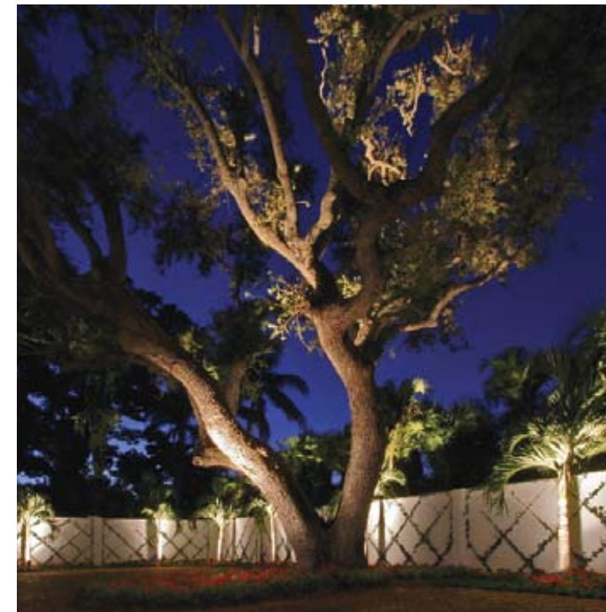
One of the three original 100 year old oak trees in the courtyard

Using old photographs from the Boca Raton Historical Society and from Benedetto, Roberts has been able to restore the appearance of the original home, even finding barrel tiles for the roof that match the ones used by Gates.