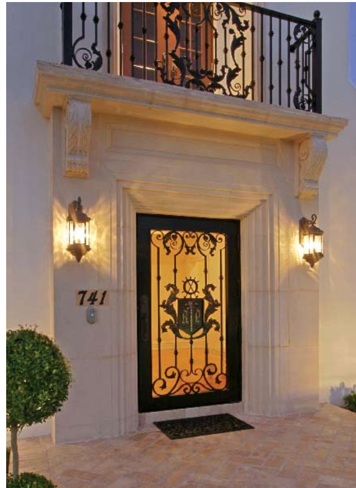
Front entry way featuring iron door with impact glass proudly displaying the Royal Palm crest