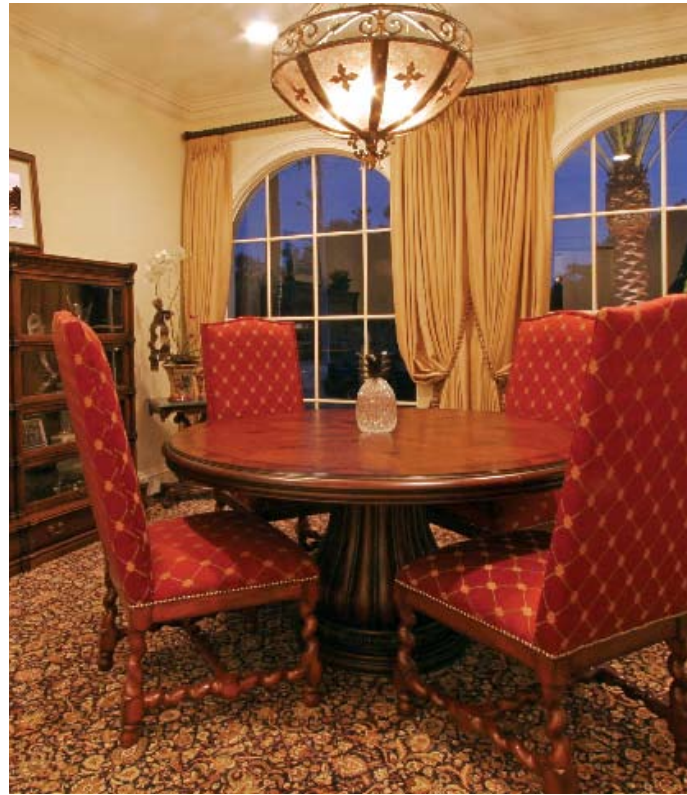
The former sun porch of Morada Bonita is now being used as the conference room

Over the years, the small two-story home with a caretaker's cottage in the back served as a residence and eventually a business. Along the way, repairs were made and some of the original features were lost.