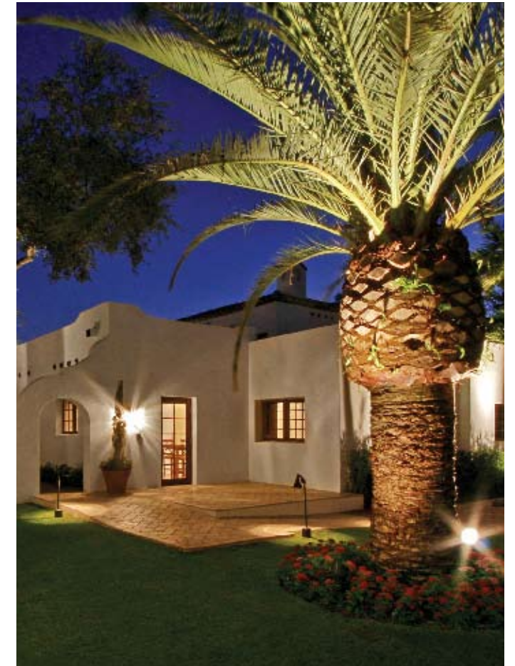
Courtyard featuring Canary Island Date Palm Tree